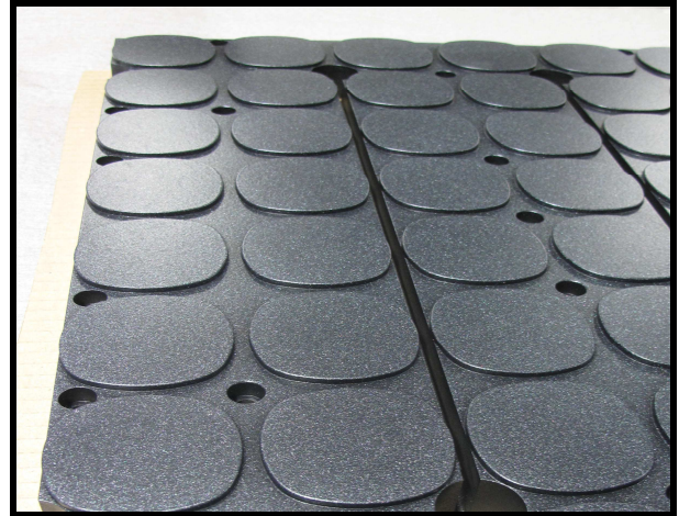
Equipment coated with Accofal 2G54

Because of its high temperature operating threshold (up to 260°C) the coating can also be used in plastic welding, and despite a relatively low coating thickness it is also well suited to coating objects which require protection from mild corrosion.