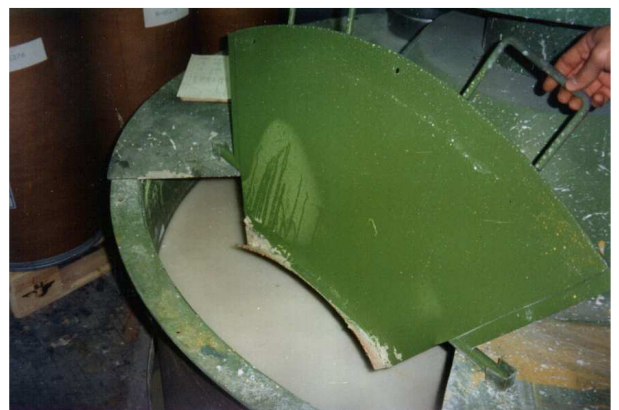
Mixing vessel for paint, Coated with Accopon GF

We provide test plates free of charge with various Accoat-coatings so as to see and feel the properties relevant and best suited for your particular job. Please contact our internal sales department.