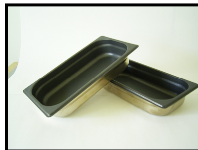
Baking trays coated with Accoflon 2C

This data sheet also covers Accoflon P348, which is a black variant of Accoflon 2C.