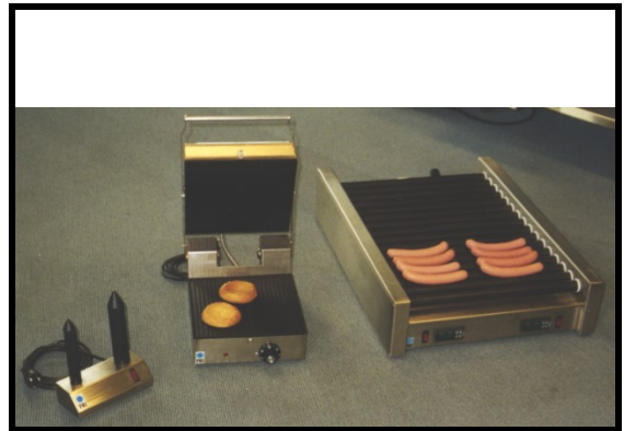
Cooking equipment coated with Accoflon 2C

Accoflon 2C can be used on any number of different products requiring a durable all-round fluorocarbon coating. Accoflon 2C has the low-friction and non-stick qualities you'd expect, and is used widely in foodstuff production and fast food equipment, e.g. plastic moulding equipment and foodstuff production and transport equipment.